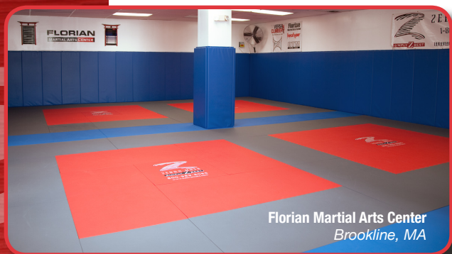
Florian Martial Arts Center Brookline, MA

More successful martial arts facilities recognize that the superior performance of Zebra's Pro Series™ MMA Mats is great for business.