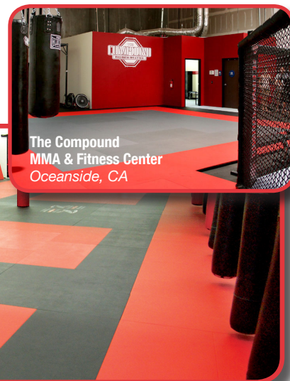
The Compound MMA & Fitness Center Oceanside, CA

An independent study pits the Zebra Pro Series™ MMA Mat against a leading roll-out MMA mat.